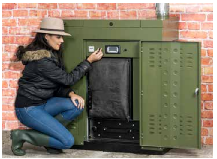
External Slim Model