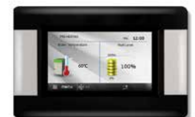
Temperature & Fuel Screen