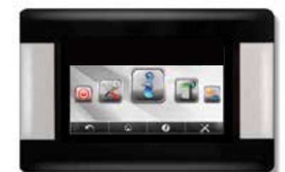
Main Menu Screen